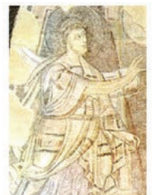
Detail of the frescoes, with the Annunciation of Zacharias.