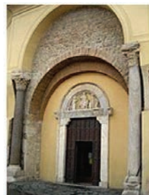
The portal of the church