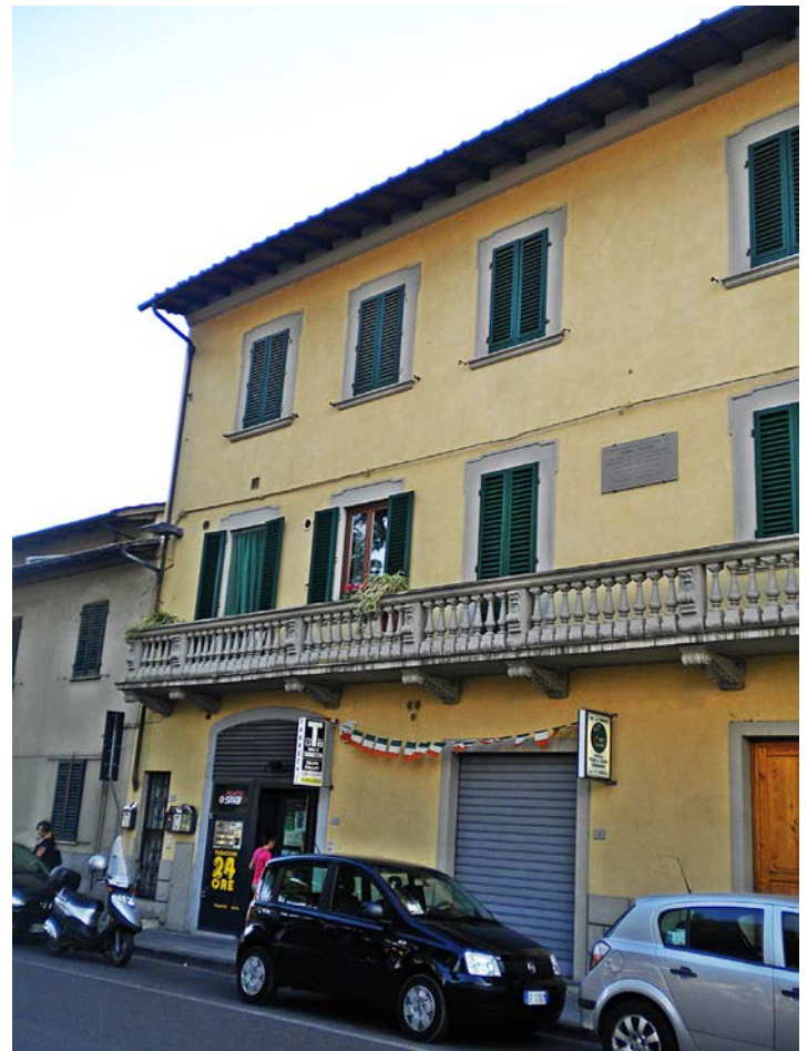
Birthplace of Filippo Mazzei in Poggio a Caiano

F ilippo Mazzei was truly one of a kind. Some may say he was a complex man. Some may say he was a dreamer. Many believe he was a patriot. Regardless, he was at one time one of Thomas Jefferson's closest friends - a confidant.