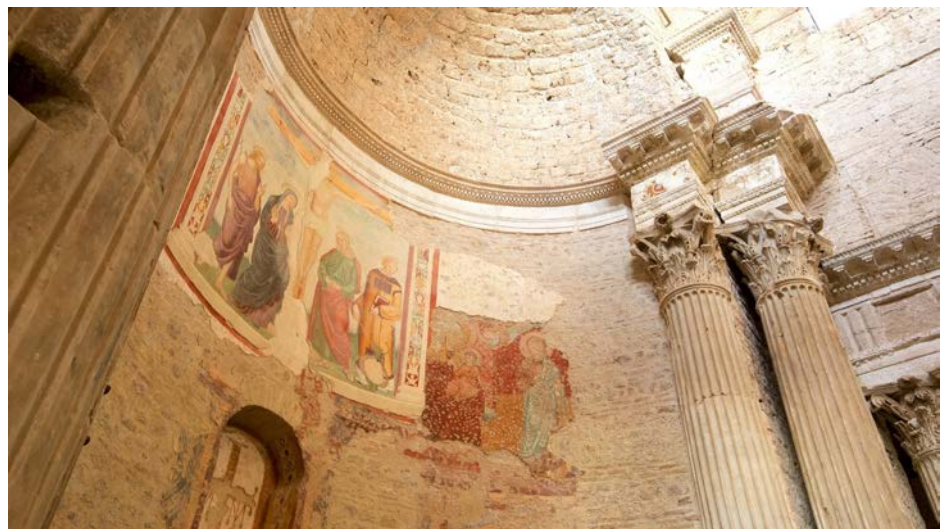
Basilica di Salvatore

This remarkable monument combines Ancient Greek and Early Medieval styles, blending classical influences with Christian symbolism. Dedicated to the river god Clitumnus, whose clear waters flow nearby and have long been revered as a vital natural resource, the Temple's design and location reflect a deep reverence for the surrounding natural landscape. The simplicity