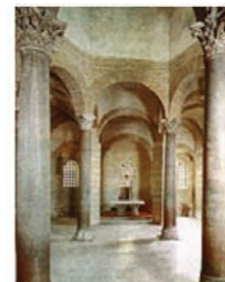
Internal view of the church