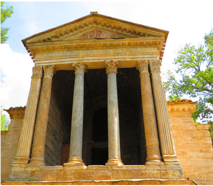
Temple of Clitumnus

Tempietto a unique architectural style. While some sculpted decorations might have been reused from older buildings, many of the Temple's adornments are original, showcasing the skill and creativity of its builders. The Tempietto is considered one of the masterpieces of Lombard art for its skillful reuse of classical remains and reinterpretation of Roman architecture.